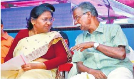
President-elect Droupadi Murmu during a visit to Dale View – a social development agency – in the state capital a few years ago