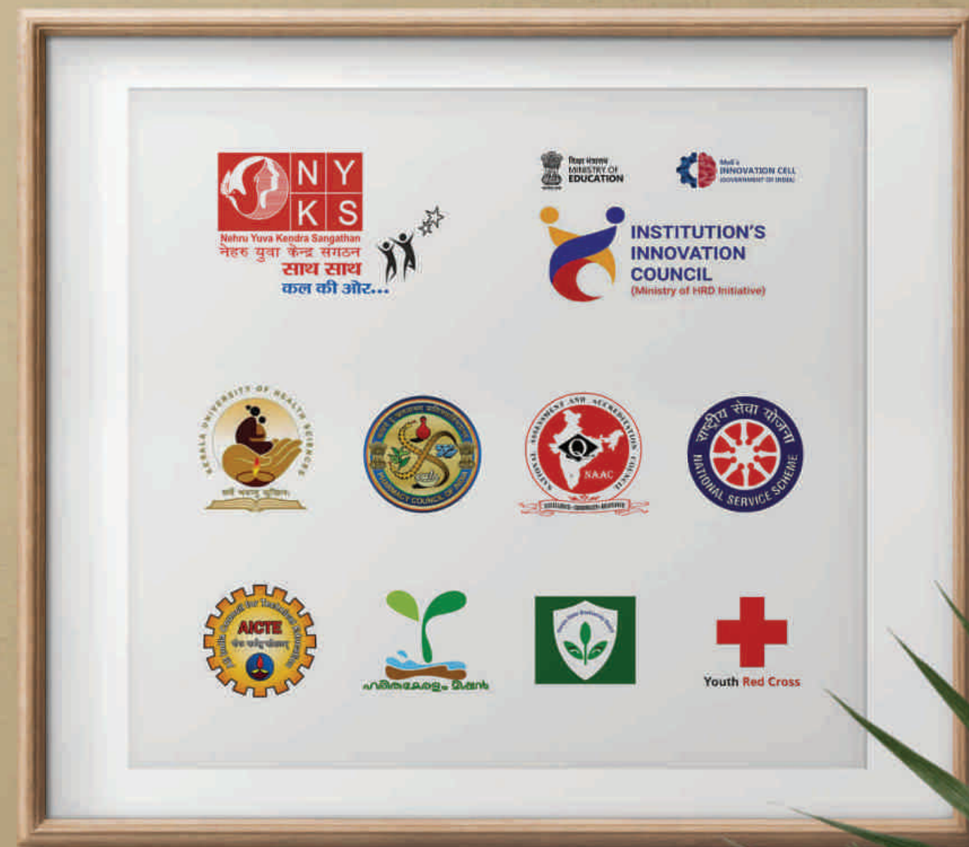
Affiliations & Linkages