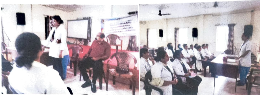
Anaemia detection camp at Yatheemkhana, Vallakadavu, Enchakkal, Trivandrum on 15 th May 2023.

Approved by PCI, AICTE and Affiliated to Kerala University of Health sciences An ISO 9001:2015 Certified Institution Accredited by NAAC Recognized under Section 2 (f) of the DDC Act 1956 Punalai, P.O., Thiruvananthapuram, Pin - 695575. Phone: 0472 2853763, 2852394, 9446802073 Website: www.daleviewcollege.com Email: dypharma@gmail.com