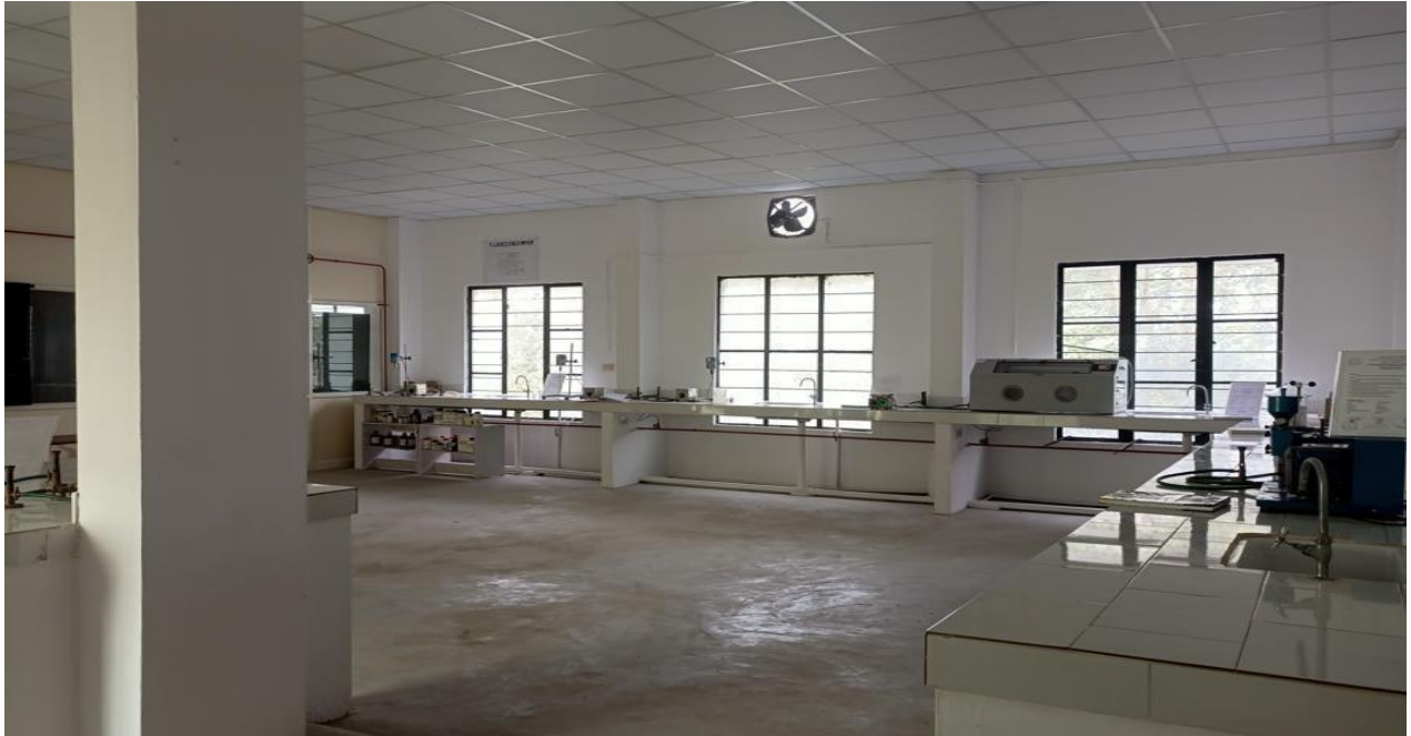
M Pharm Pharmaceutics lab

Website: www.daleviewcollege.com Email : dvpharma@gmail.com