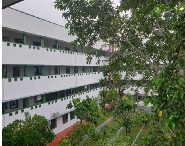
Back side college view

Website: www.daleviewcollege.com Email : dvpharma@gmail.com