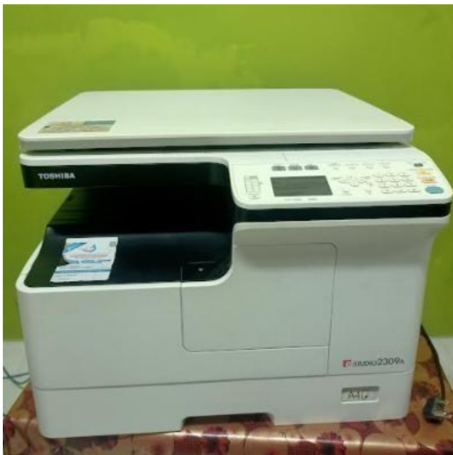
XEROX MACHINE AT LIBRARY