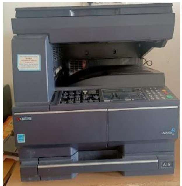
XEROX MACHINE AT EXAM DEPARTMENT