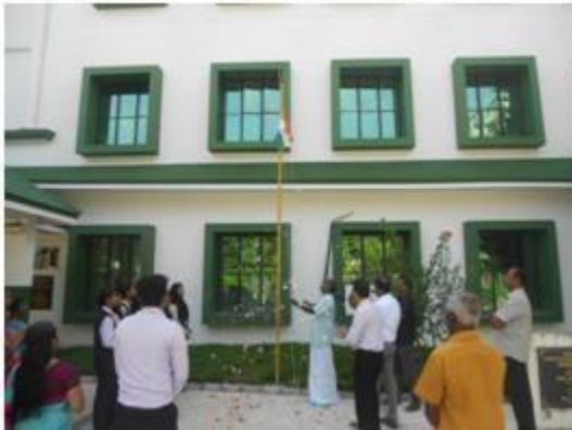
Republic day celebration