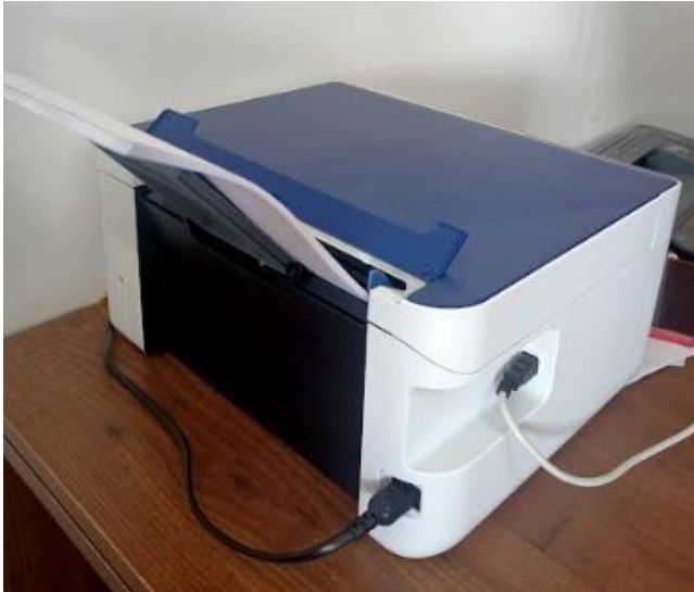
PRINTER AT ACCOUNT SECTION

Website: www.daleviewcollege.com Email : dvpharma@gmail.com