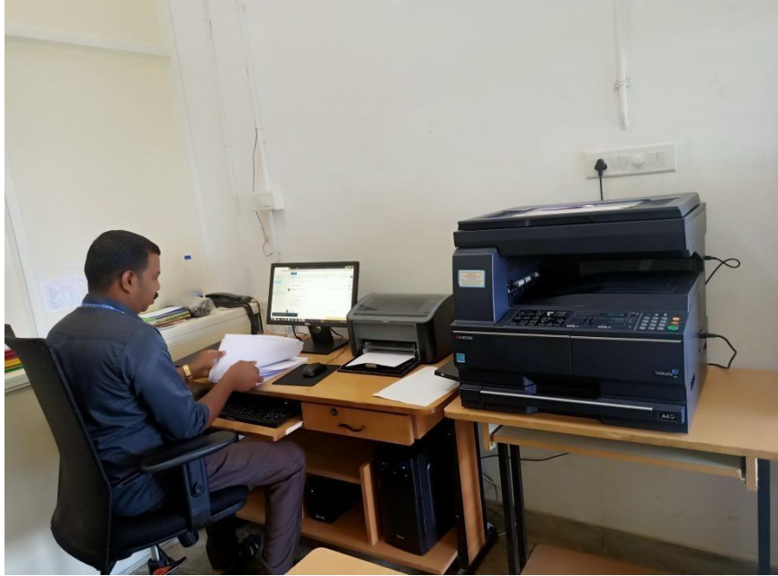
PRINTER AND XEROX MACHINE AT OFFICE

Website: www.daleviewcollege.com Email : dvpharma@gmail.com