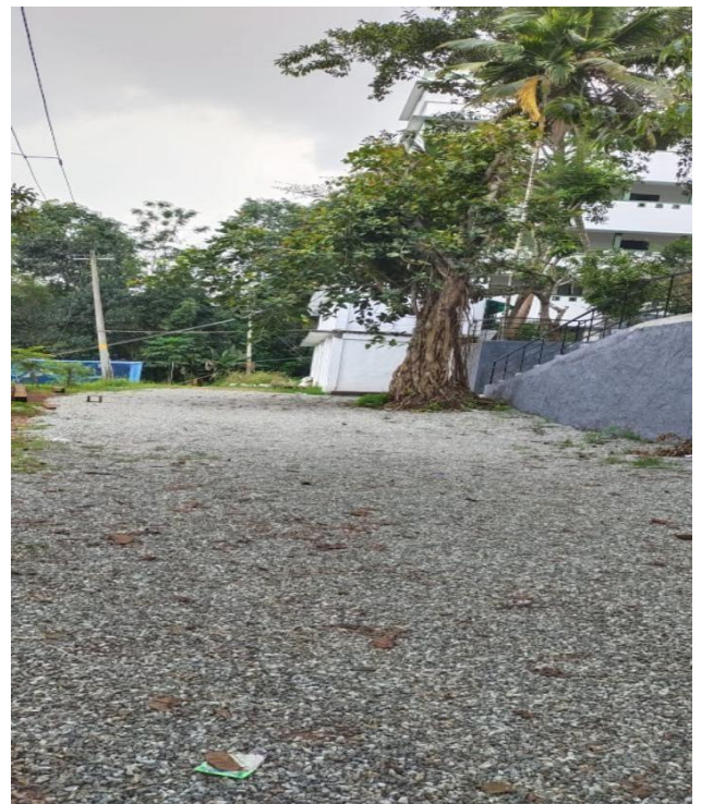
Foot path near sports area