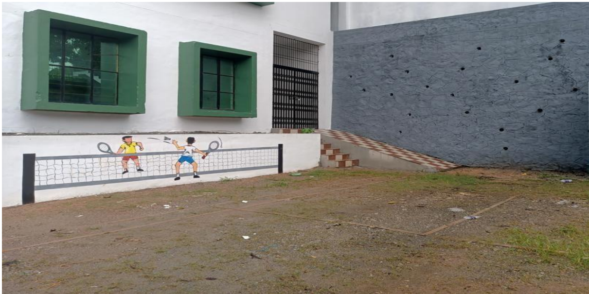
Shuttle court area