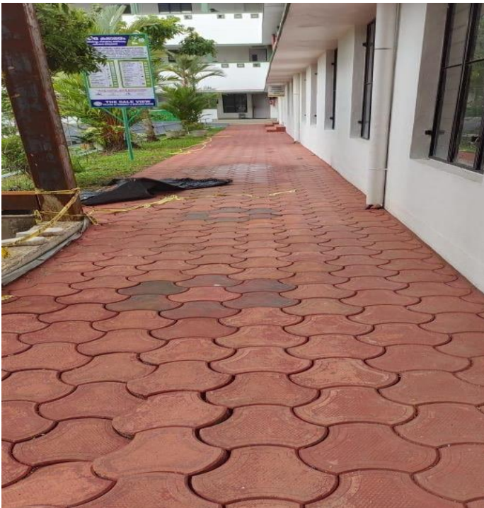
Foot path near herbal garden