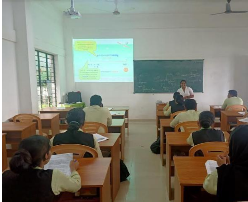
PHARM D CLASS ROOM

Website:www.daleviewcollege.com Email : dvpharma@gmail.com