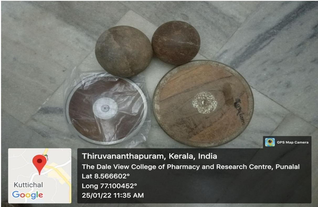
Shot put ball and Disc

Website:www.daleviewcollege.com Email : dvpharma@gmail.com