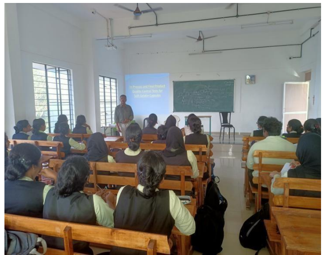
B PHARM CLASS ROOM