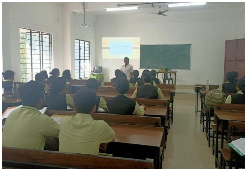
D PHARM CLASS ROOM