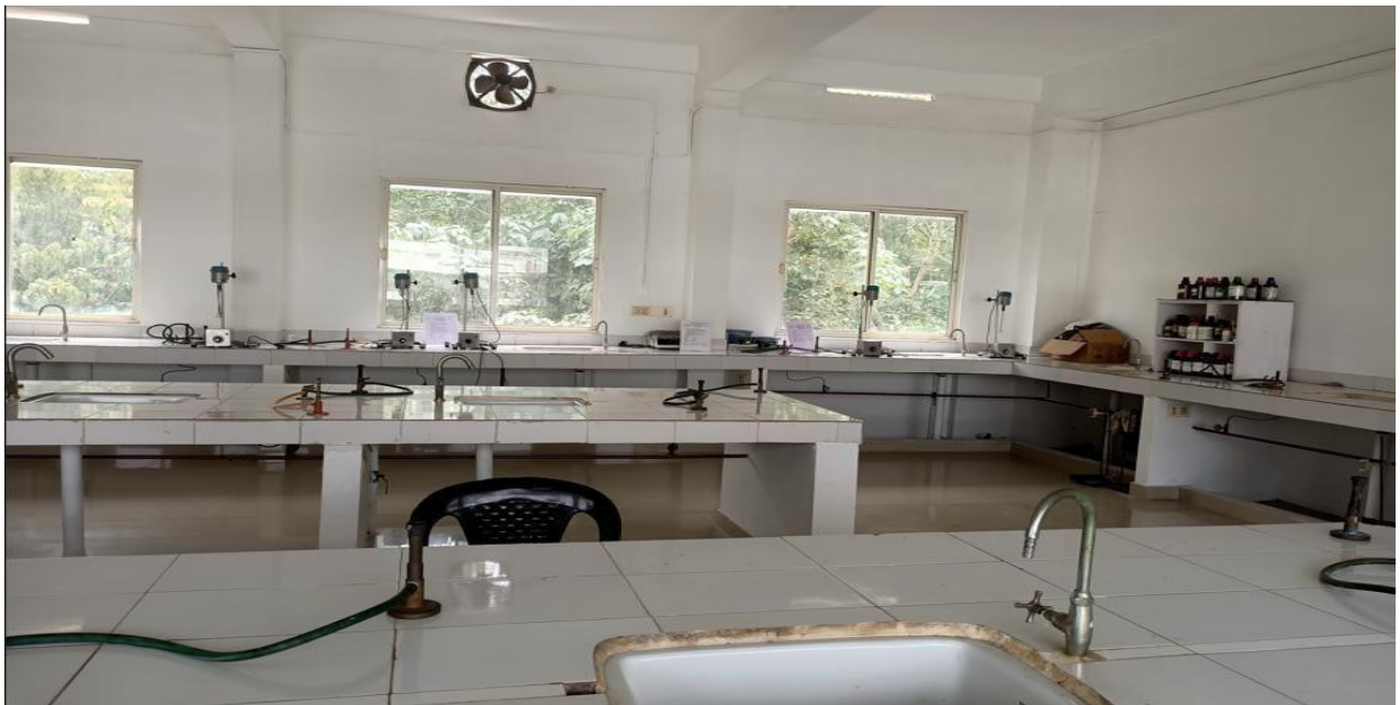
M pharm Pharmaceutical Chemistry lab