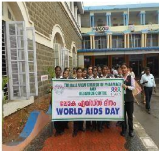
World aids day